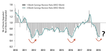
EARNINGS REVISION RATIO OF GLOBAL COMPANIES BY FINANCIAL ANALYSTS

Source: Bank of America Merrill Lynch, 31/03/2019