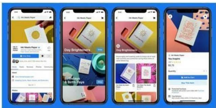
Facebook Shops will allow sellers to create digital storefronts on Facebook or Instagram

“Facebook Shops” will allow sellers to create digital storefronts on Facebook or Instagram.