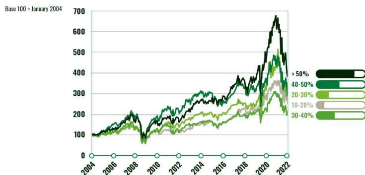
The stock performance according to the share of the company held by the same family

Looking again at the period from January 2004 to October 2022, the stocks of businesses that are more than 50%-owned by the founding family post much higher gains than companies with lower family stakes. This is largely due to better alignment between the interests of shareholders and management. Such majority-owned businesses are also less subject to the demands of minority shareholders whose interests may not be consistent with those of management and/or the company's long-term goals.